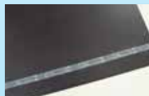
Bravo 200 sq. ft. per roll I32VS